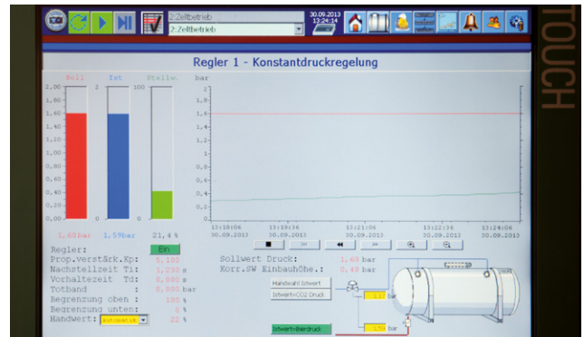
Fig. 3 The red actual line shows perfectly constant maintenance of the beer pressure at 1.6 bar. The setpoint line is hiding behind the actual line. The resolution of the display is adapted to the new conditions in the display.